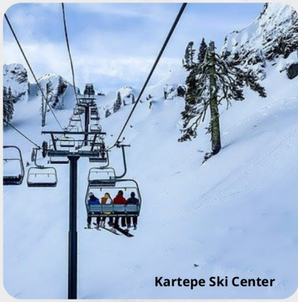
Kartepe Ski Center