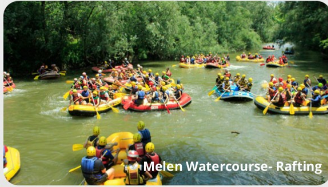
Melen Watercourse- Rafting

Sakarya province hosts numerous activities intertwined with nature. In the city, activity areas such as ski centers, paragliding, and rafting are located 20 minutes away from the campus. Bicycle use is widespread with urban cycling routes. Transportation is also provided by minibusses and buses.