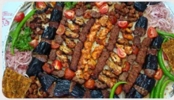
Many Kebab Restaurants