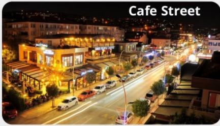
Serdivan Cafes Street - 10 minutes to the campus.