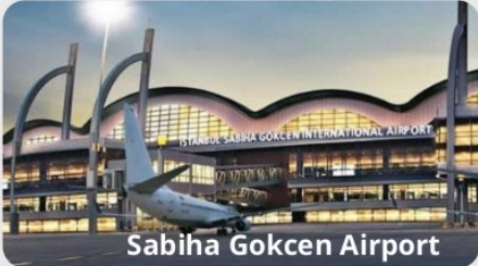
Sabiha Gokcen Airport

Apart from the daily meals offered by the school cafeteria, there are many restaurants that contain the tastes of Turkish and International Cuisines.